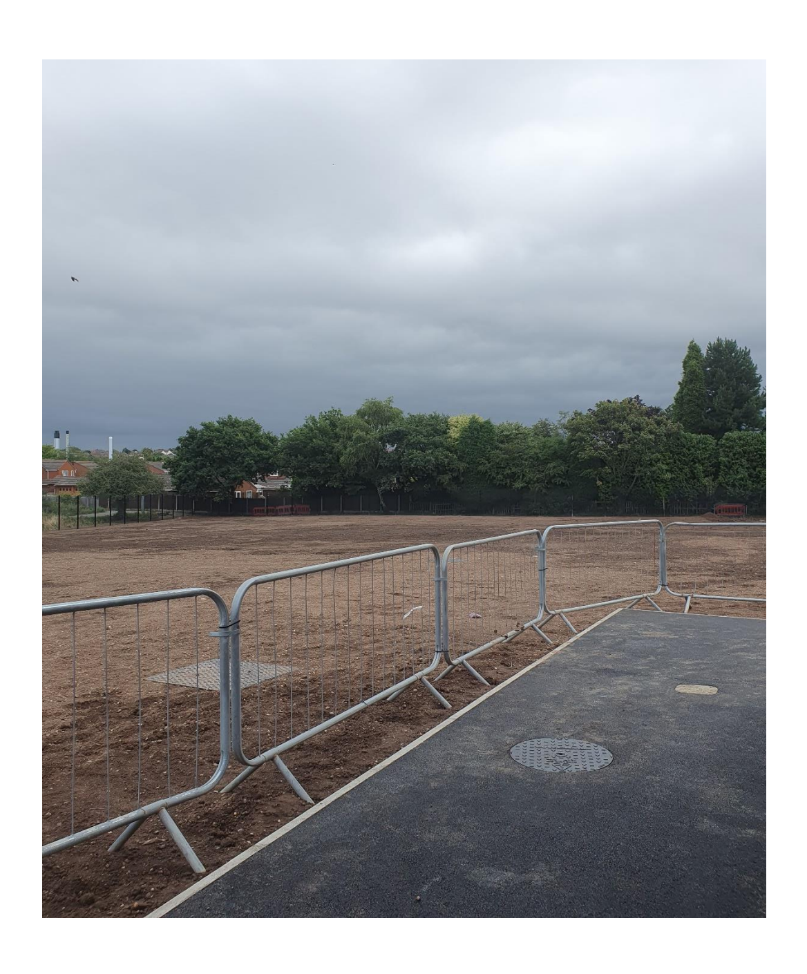
Field to rear of New Build (2)