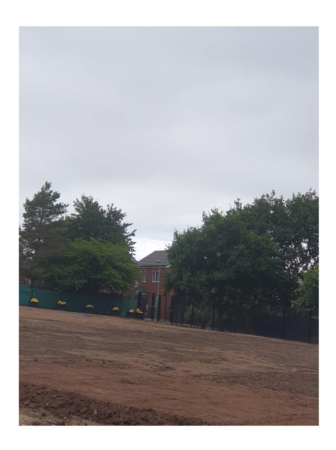
Field to rear of New Build (1)