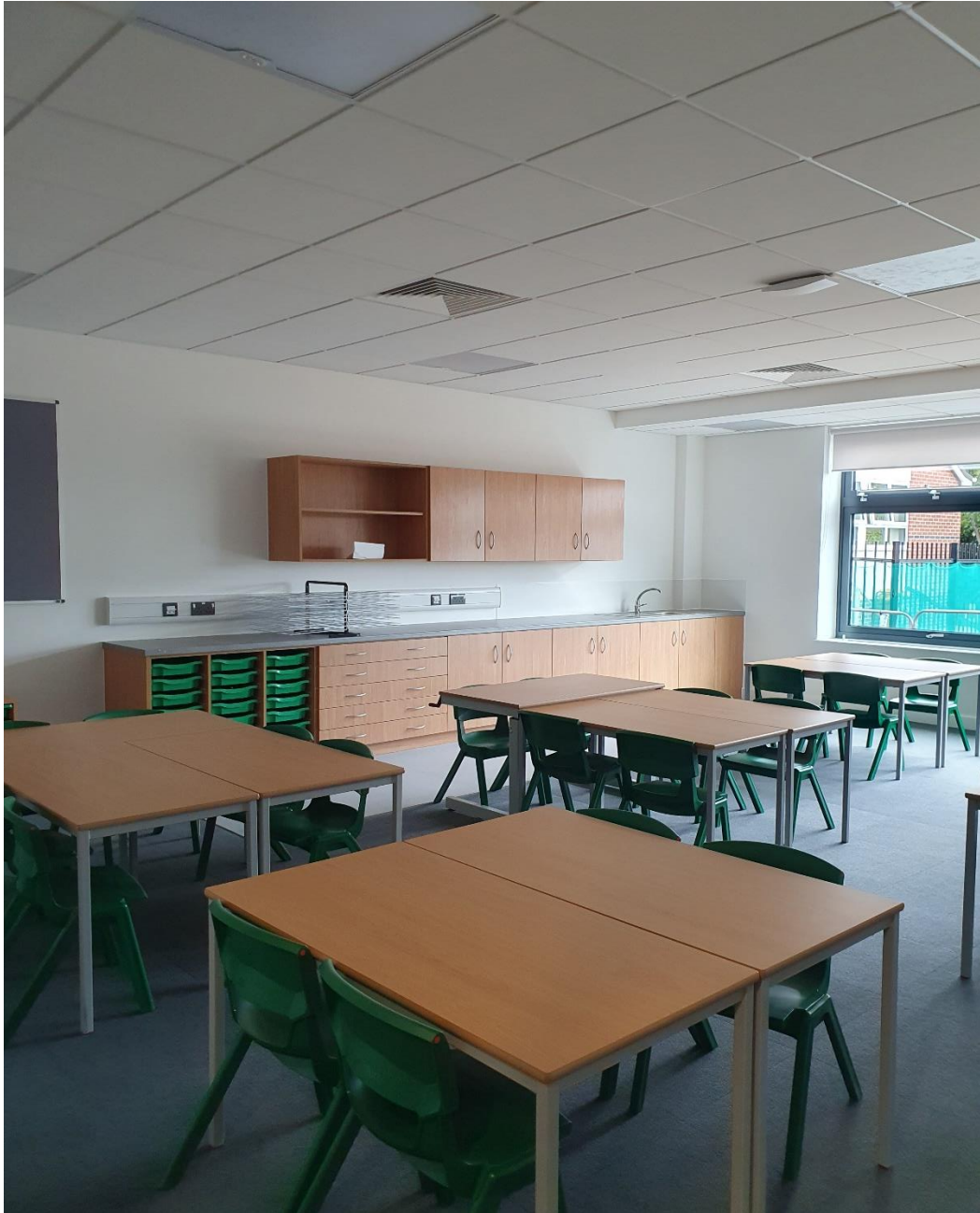
Typical Classroom 1