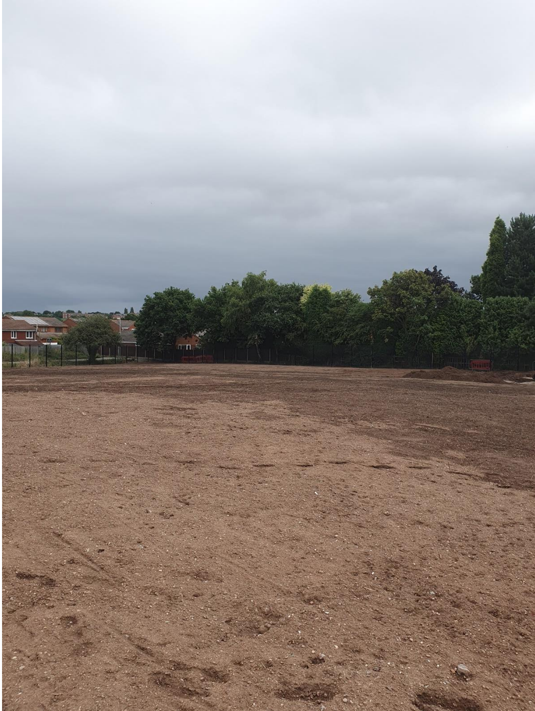
Field to rear of New Build (2)