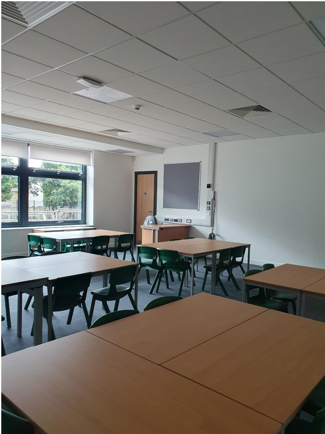
Typical Classroom 2